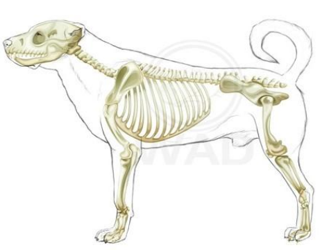
TURKISH SHEPHERD DOG BOZ