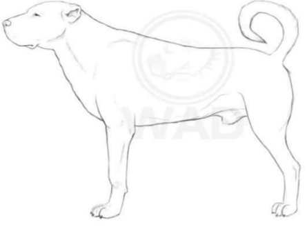
TURKISH SHEPHERD DOG BOZ

<u>Size</u>: Shoulder length for adult males is between 75-85 cm, and weight is 60-80 kg. Also seen is a shoulder length of 90 cm and a weight of 100 kilograms. As for adult females, shoulder length is between 70-80 cm in adult females, and the weight is 50-65 kilograms. Also seen in females is a shoulder length of 85 cm and weight of 70 kilograms.